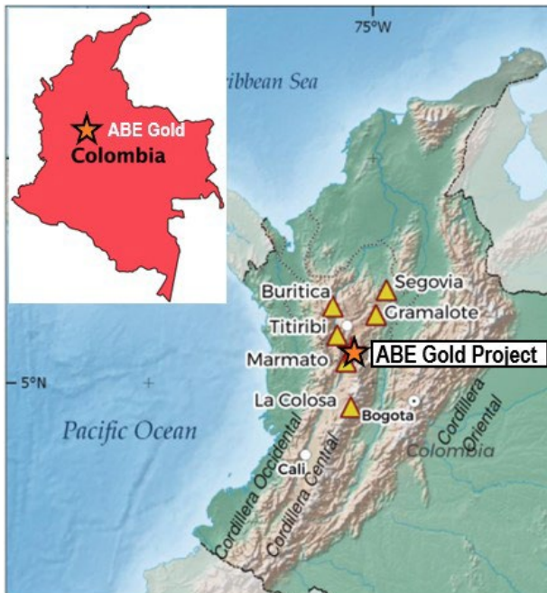
Figure 1. ABE Gold in NW Colombia

“Prudent’s fully funded 2023 exploration program commences in late January, focusing on validating the continuity of the newly discovered Purimac structural corridor,” he concluded.